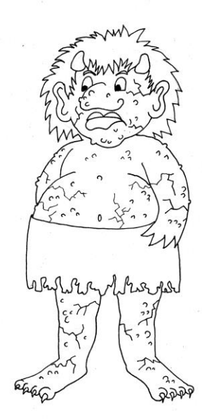
Figure 4. Go over all the important lines in black pen. Erase all the pencil marks.