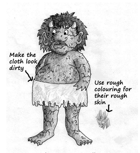
Figure 5. Colour in your Troll. Give him (or her) a really ugly name.