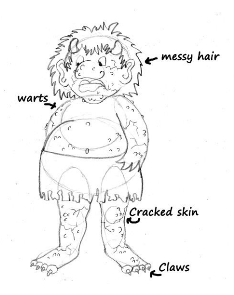
Figure 3. Add more details (still in pencil) like hair, warts and cracks in the skin.